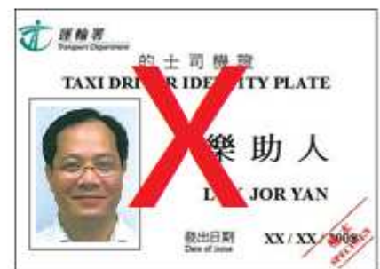
Old version (in white colour) is invalid

(c) a taxi driver identity plate in a holder.